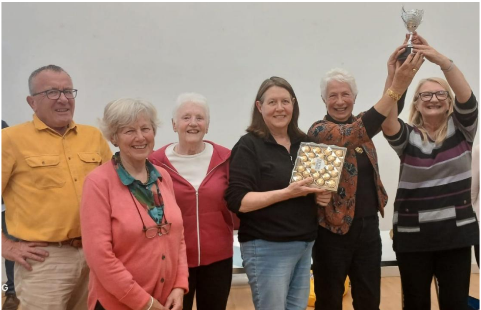
We Haven't a Clue – Winners of Launceston u3a quiz 2026

Two teams finished on 111 points each. A tie-break question decided the winners – We Haven't a Clue who claimed our glistening Trophy and a box of chocs. There were prizes too for runners-up Tiger Tiger (Callington u3a) and The Folk Clubbers who came a close 3 rd on 109 points. Congratulations to one and all! As for my team No Eye Dears - suffice it to say we are bearing up well under the strain of a humiliating defeat!