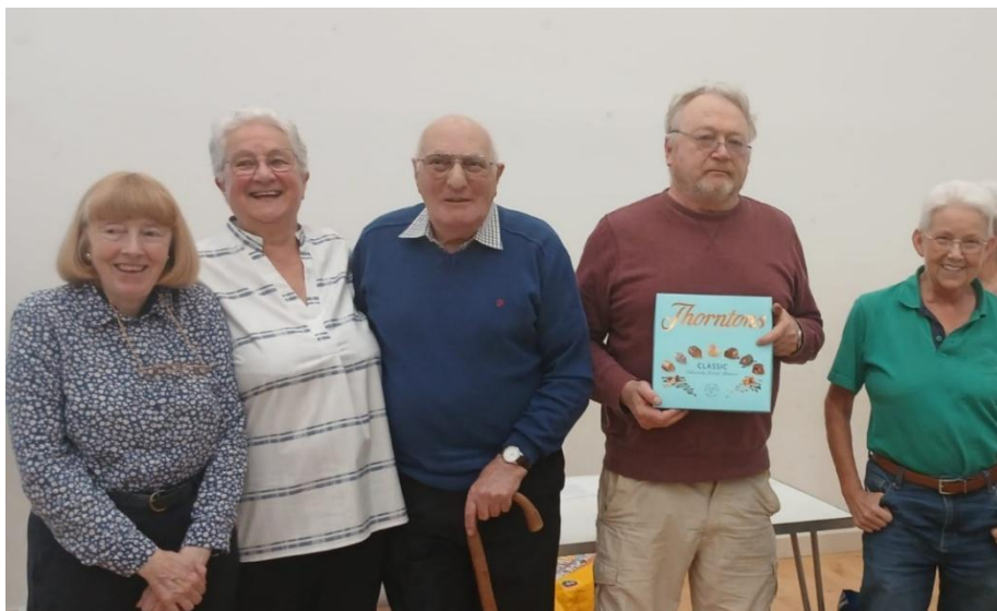
Tiger Tiger ( Callington u3a )