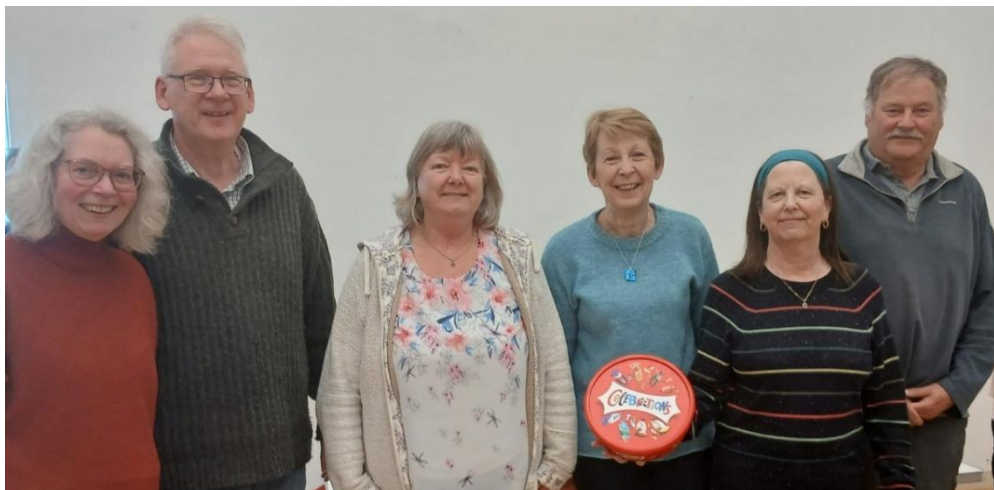
The Folk Clubbers