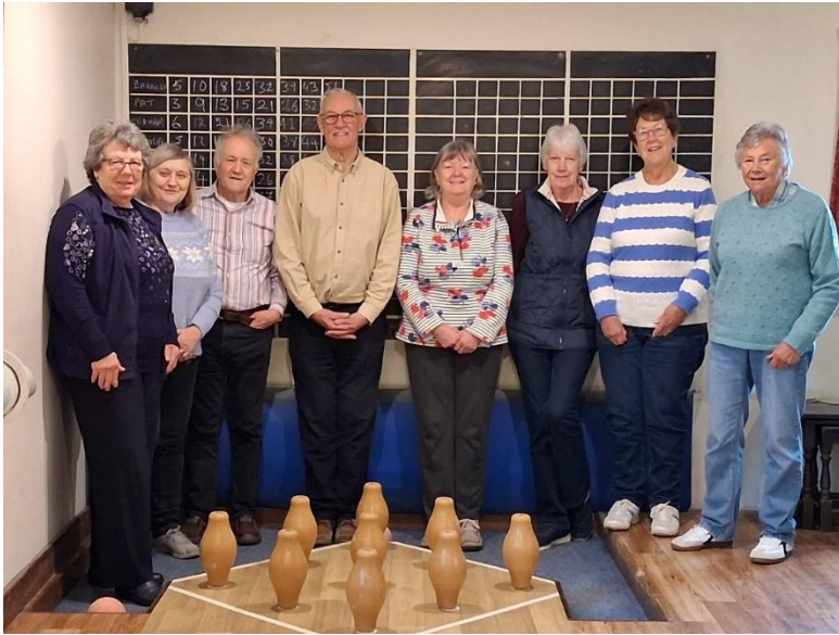
Skittles Group Members